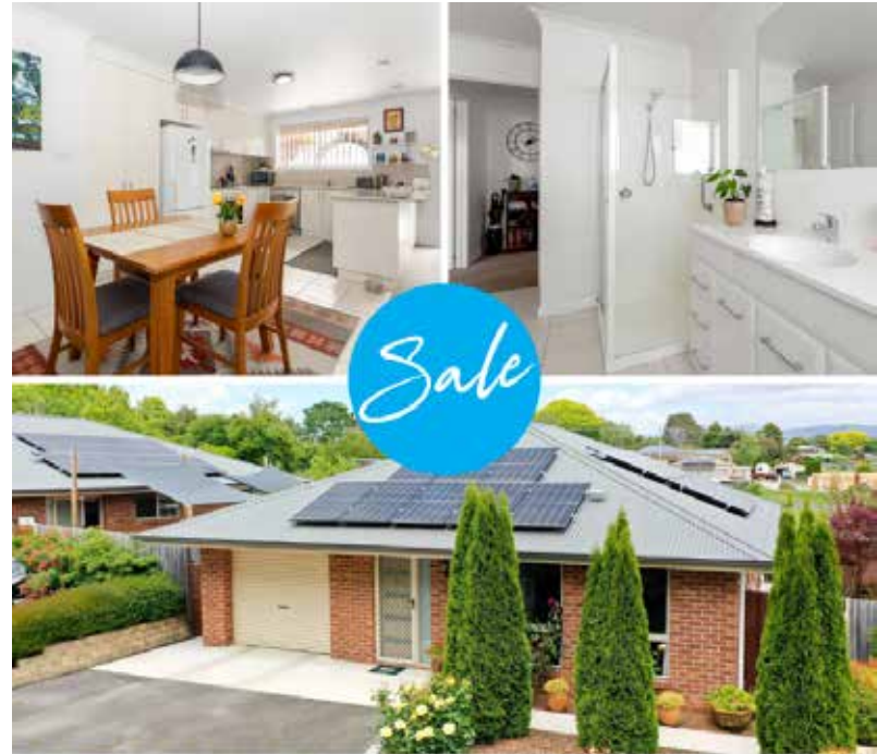
3/25A Adelaide Street, Westbury, TAS 7303 Best offers over $455,000