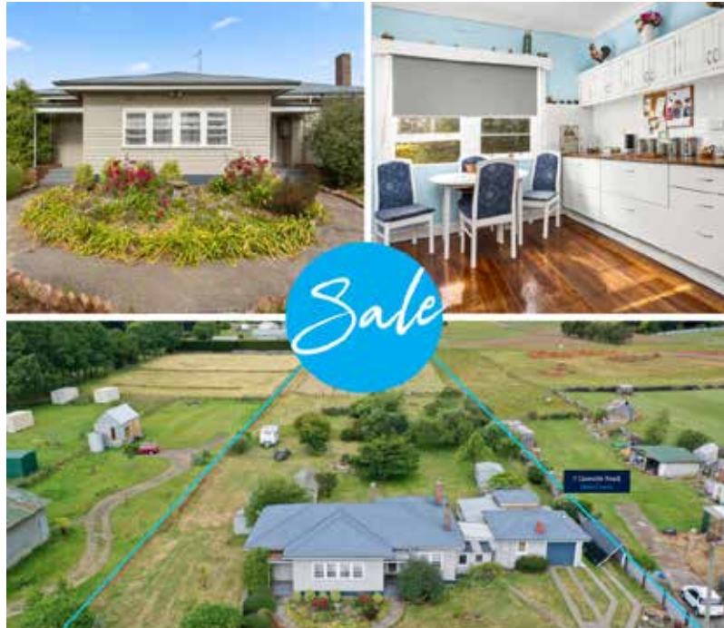
7 Caveside Road, Mole Creek, 7304 Best Offers Over $535,000

Make your property dreams come true this summer! We will get the job done!